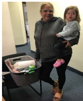
"Gracias for helping my family"