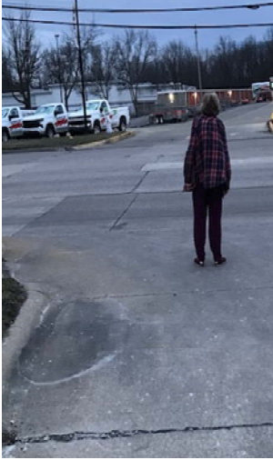
Sandy, the road ahead is ripe for church outreach.....